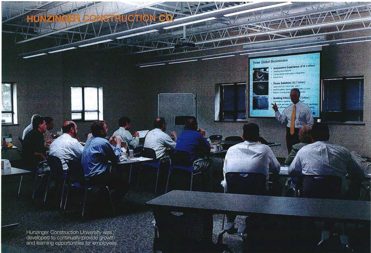
Hunzinger Construction University was developed to continually provide growth and learning opportunities for employees.